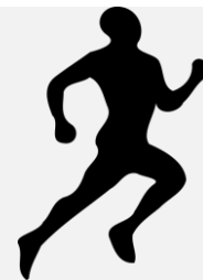
Terry Fox Run